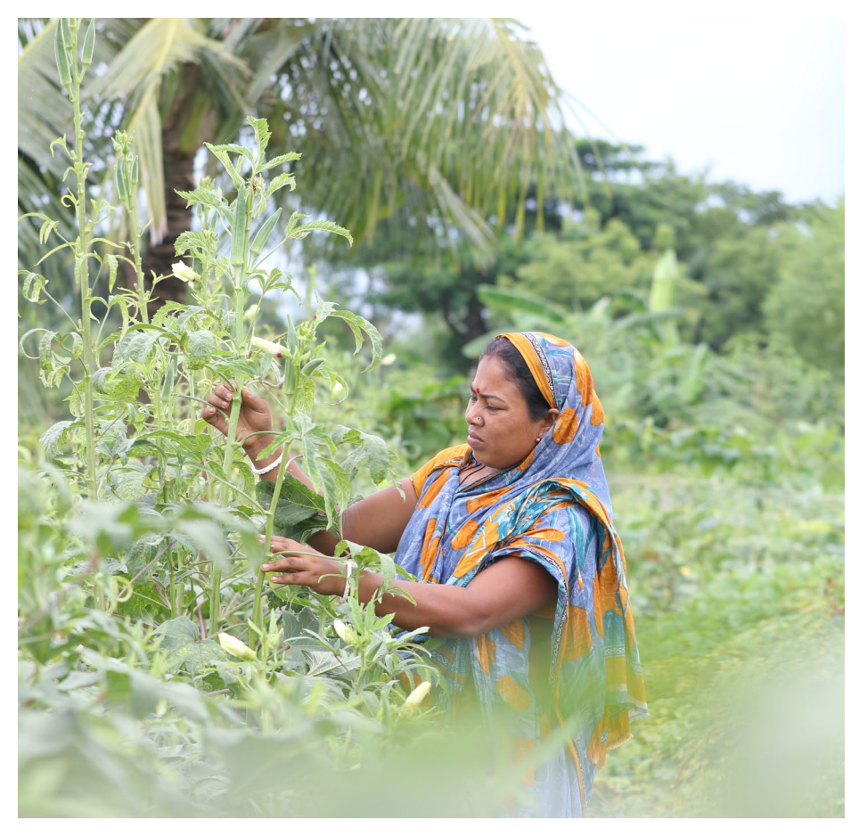
Gardening on a biodyke to provide protection and additional livelihoods with Practical Action in Bangladesh as part of the Global Resilience Partnership's Water Window