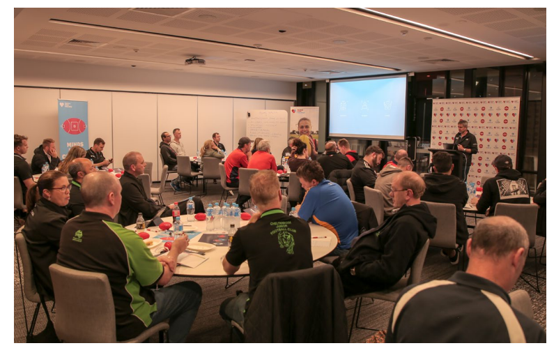
First ever TYF session at St. Kilda football club in Moorabbin, Victoria.