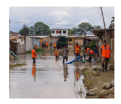
Brigades and armed forces in action during floods – Piura, Polvorines.

The work has also developed a brand identity, which ensures consistency of message from all members of the Alliance. This is particularly important if the Alliance is to realize the benefits of acting collectively, rather than as a group of individual organizations.