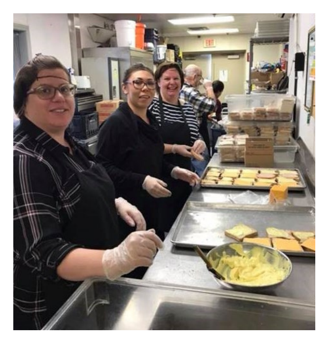
Zurich Canada employees volunteering to support the Mustard Seed Foundation's beneficiaries.

"We are so grateful for this partnership between the Z Zurich Foundation, Zurich and The Mustard Seed Foundation. Without your investment, we wouldn't be helping as many people as we are today. Your generous donation was the beginning of a relationship that saw many volunteer hours from the Zurich team, lots of tours and introductions, and most importantly deep compassion. Zurich Canada, and the Z Zurich Foundation, have had a life-saving impact on countless numbers of people experiencing homelessness."