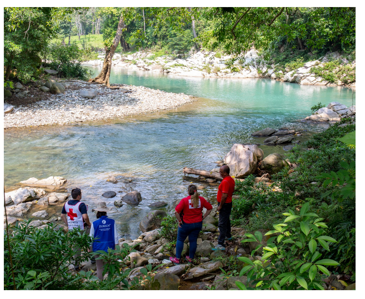
An Alliance Team visits a section of a river in Chiapas, Mexico, upstream from the communities with whom the Alliance is working. The pristine natural state of the river is one of the key assets the community has, but the community is becoming increasingly afraid of floods and has the perception that only 'construction' can 'fight' the river. The Alliance wants to include more natural, ecosystems-based approaches to flood resilience building.

This summary outlines the progress made by the Alliance in the first year of Phase two. A more detailed analysis of the year is available in the learning report.